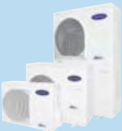
Single split: 38VYX_N